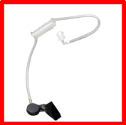
Replacement Earpiece Part with Transparent Acoustic Tube Kit POA156