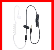
Earbud with Transparent Acoustic Tube (Receive-Only) EA-01