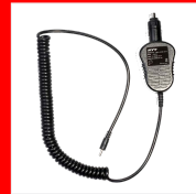
Vehicle Power Adapter CHV09