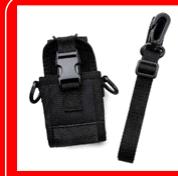
Nylon Carrying Case (not swivel)(black) NCN001

Note: Pictures above are for reference only and may vary from actual product.