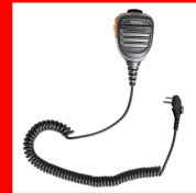
Remote Speaker Microphone SM26M1