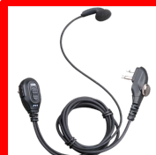
Earbud with on-MIC PTT & VOX ESM12