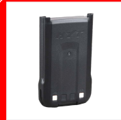
Li-Ion Battery (1650mAh) BL1719