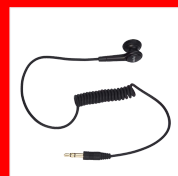
Receive-Only Earbud, 3.5mm plug ES-01