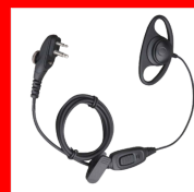
D-style Earpiece with in-Line MIC & VOX EHM15-A