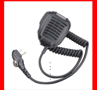
Remote Speaker Microphone SM08M3